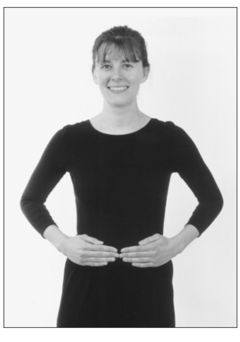
Most people who learn reiki use it on themselves to maintain wellness.

but the method was rediscovered in Japan in the early twentieth century by a man named Mikao Usui. Reiki is now