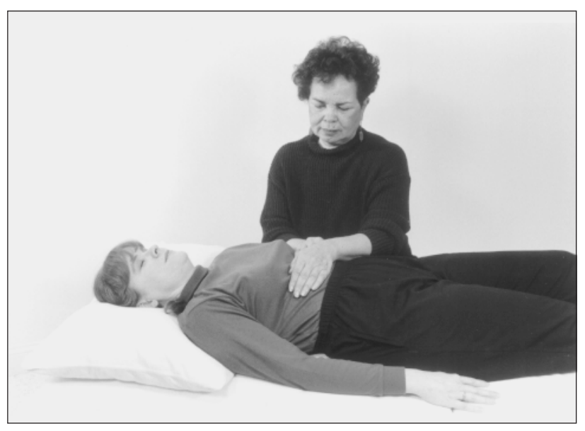
Receiving reiki is so relaxing that many clients fall asleep during a treatment.

In chiropractors' offices, clinics, spas, hospitals and other health care settings, reiki is given as a formal treatment. As the client rests, comfortably clothed, on a bodywork table, a trained practitioner applies her hands in a series of standard positions that cover the front and back of the torso and the head. This focuses healing energy to the major organs of the body. The client may request treatment on other areas as well.